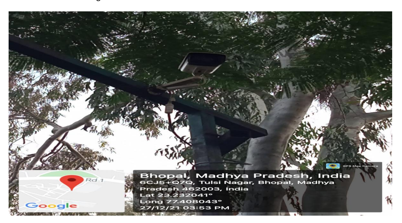
CCTV at Entrance